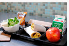
Craisin Chicken Wrap