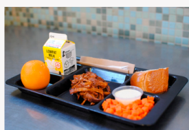
BBQ Baked Pork