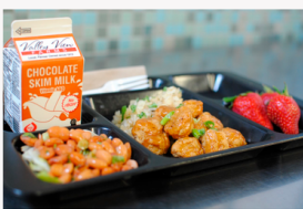
Sesame Popcorn Chicken