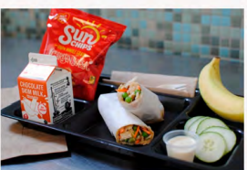
Asian Chicken Wrap