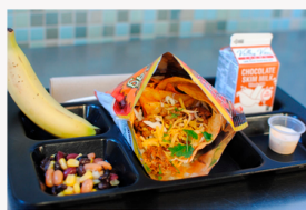
Walking Beef Taco