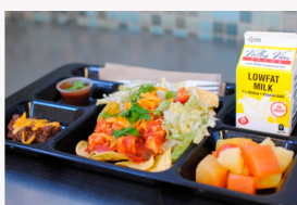
Chicken Enchilada Nachos