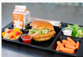
Chicken Patty Sandwich