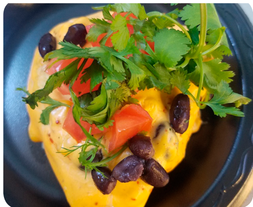
Southwest Cheddar Chicken