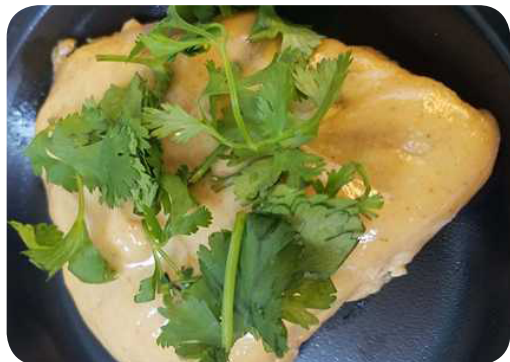
Chicken Satay Curry